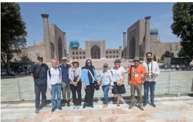
Convention attendees at the Registan in Samarkand