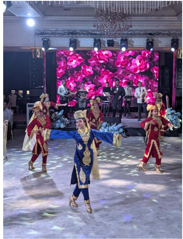
Entertainment at the Closing Banquet