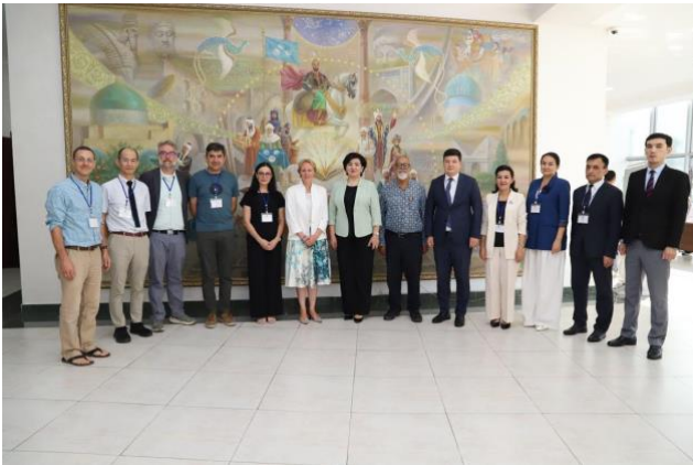
Members of the ASPS Board meet with Representatives of Tashkent State University of Oriental Studies