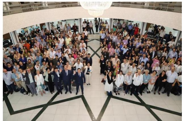
Convention Participants at the Opening Reception

We look forward to seeing you in 2027... location to be announced soon!